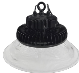
22" PC Cover (60°, 120°)