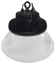
19" PC Cover (60°, 90°)