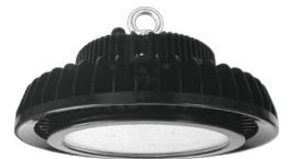
PC Lens (60°, 90°) Glass (120°)