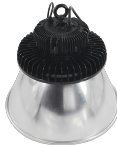
AL Cover (60°, 90°, 120°)