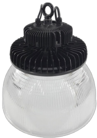
16" PC Cover (60°, 90°, 120°)